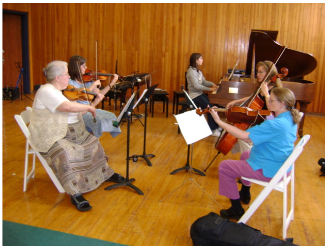
Piano with strings class, Student Institute 2009

Twinkle A, Cuckoo, French Children's Song, Good-bye to Winter, Happy Farmer, Arietta, Beethoven Sonatina in G (1st mov't), Kuhlau Sonatina, Beethoven Sonata op 49, Chopin Waltz in a minor, Bach Prelude in C major. Advanced players will do chamber music: Beethoven op. 1 no. 1 (1 mv't), Mendelssohn Trio in d (II), Mozart Trio in Bb (1 mv't), or Bach Trio from "Musical Offering".